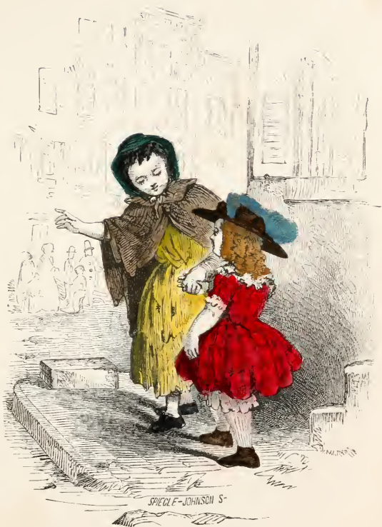
“Taking his hand, they went out softly.”—Page 16.